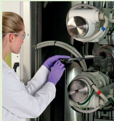
Opposing X-ray tubes