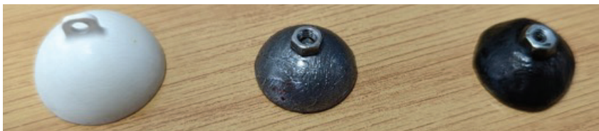
Eye shields come in multiple colors and sizes.

Internal eye shields for use during superficial and orthovoltage radiation therapy treatments are now available from Xstrahl. They are CE marked and quality tested to ensure the safest eye protection for your patients. If you have any questions on the internal eye shields, please reach out to us at xstrahl.com/eye-shield-questions .